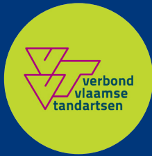
Belgium — VVT