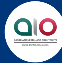
Italy — AIO