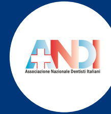
Italy — ANDI