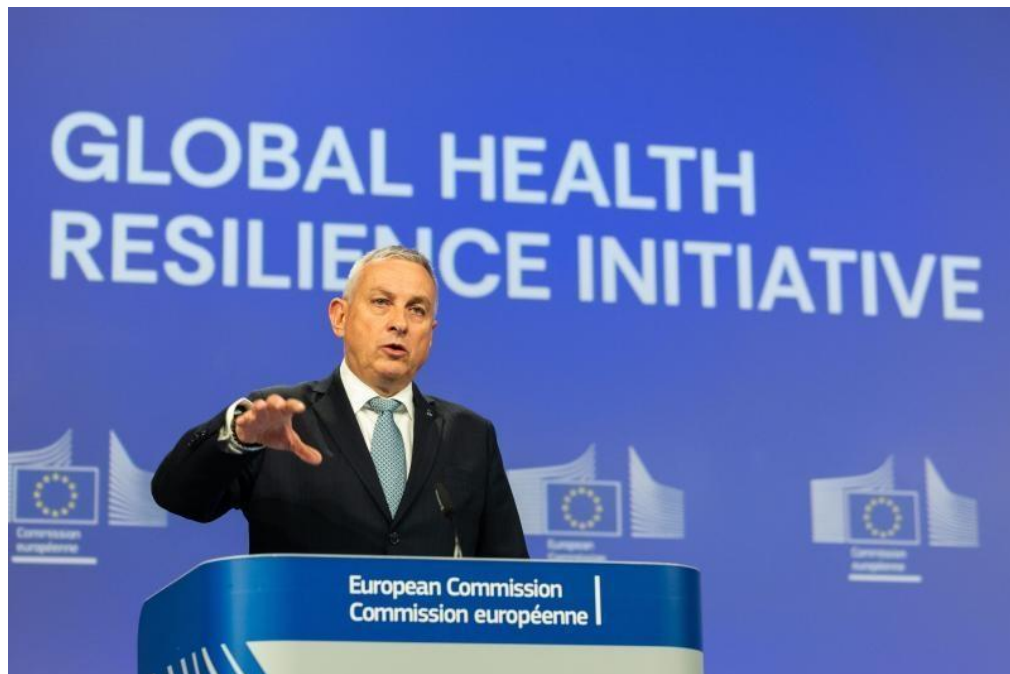
Jozef Sikela, Commissioner for International Partnerships