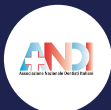
Italy – ANDI