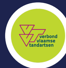
Belgium – VVT