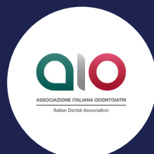
Italy – AIO